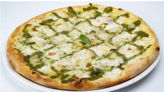
Artichoke & Ricotta Pesto Pleasure (1310 Cal.) AED 50

Artichoke, Red Onion, Creamy Ricotta, Pesto Sauce and Hand-Sliced Mozzarella Cheese