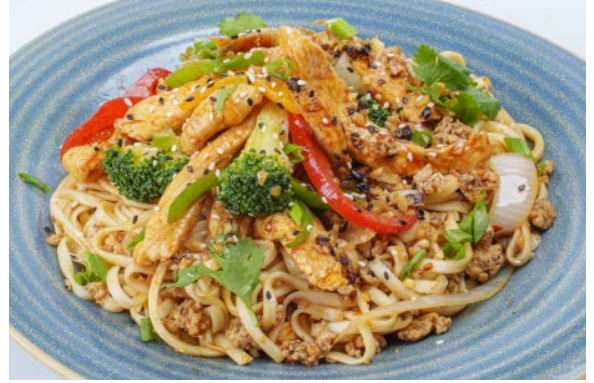
The Gochujang Noodles (590 Cal.) AED 50/46/55

Korean Gochujang Sauce, Pan-Fried Noodles, Bell Peppers, Onion, Garlic, Ginger, Sesame Seeds.