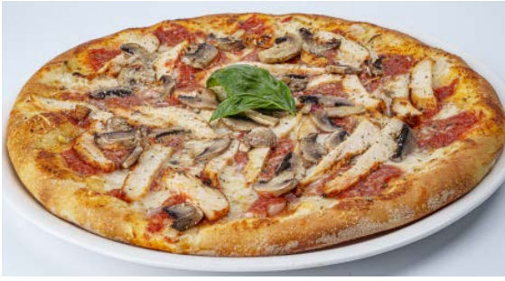
Chicken Fungi Fusion (1480 Cal.) AED 52

Grilled Chicken Breast, San Marzano Tomato Sauce, Hand-Sliced Mozzarella Cheese, Mushroom, Red Onion, Truffle Oil and Fresh Basil