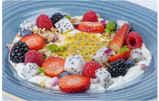
Granola Parfait (760Cal.) AED 38

Greek Yogurt, Mixed Berries, Passion Fruit, Granola, Coconut Panna Cotta, Dragon Fruit and Honey.