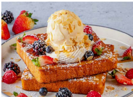
Classic French Toast (860 Cal.) AED 36

Brioche Bread, Caramel Mousse, Mixed Berries, Vanilla Ice Cream served with Maple Syrup.