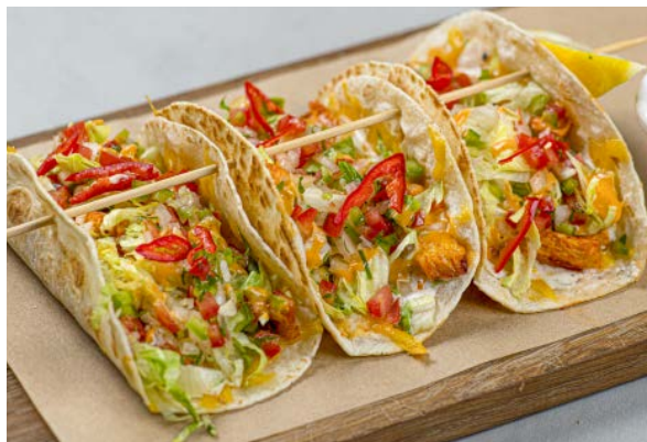
Chicken Tacos (1250 Cal.) AED 42

Flour Tortilla, Grilled Chicken Breast, Lettuce, Pico De Gallo, Cheddar Cheese, Cilantro, Ranch and Sriracha Mayo.