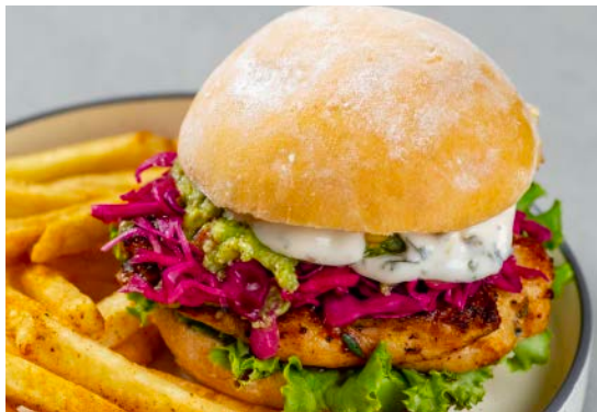
Mexican Grilled Chicken Burger (1080 Cal.) AED 44 Tex-Mex Grilled Chicken Breast, Red Cabbage Slaw, Creamy Corn, Guacamole and Jalapeño Mayo. 🍷🌾