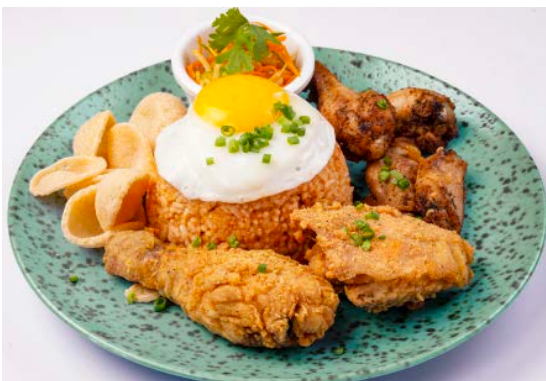
Bokkeumbap (1120 Cal) AED 49

Fried Chicken, Chicken Wings, Fried Egg, Prawn Crackers with Chili Garlic Rice and Asian Slaw.