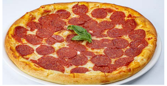
Traditional Honey Pepperoni (1610 Cal.) AED 52

Beef Pepperoni, San Marzano Tomato Sauce, Hand-Sliced Mozzarella Cheese and Honey on the side.