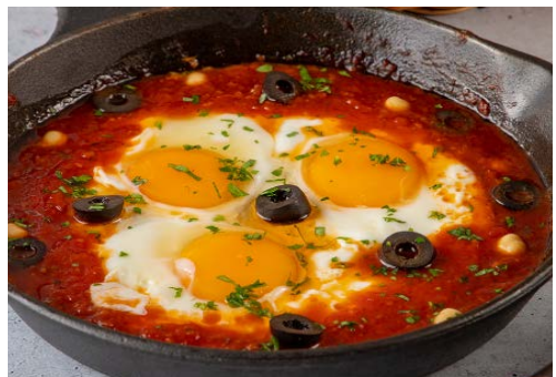
Meat Shakshouka (810 Cal.) AED 40

San Marzano Tomato, Ground Beef, Eggs, Olives, Bell Peppers, Feta Cheese, Olive Oil, and Za'atar Pita Bread.