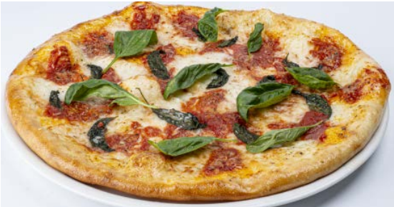
Margherita (1240 Cal.) AED 44

Traditional Pizza, San Marzano Tomato Sauce, Hand-Sliced Mozzarella Cheese and Fresh Basil