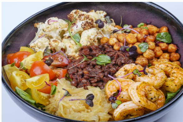
Lentil Ginger Shrimp Salad (470 Cal.) AED 46 Grilled Shrimp, Lentil Ginger, Roasted Chickpeas, Cauliflower, Cherry Tomatoes, Braised Fennel and Orange Vinaigrette Dressing.