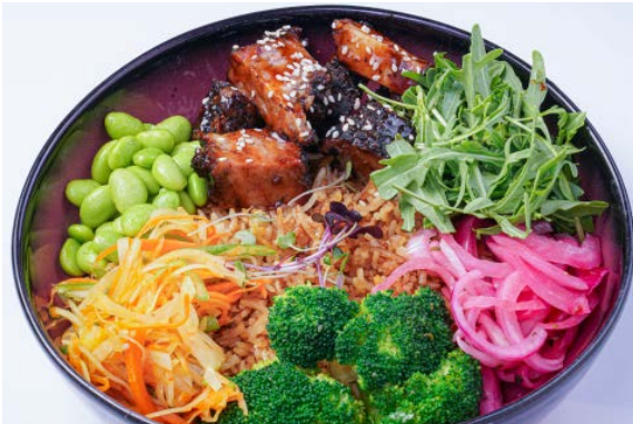
Burnt Ends & Rice (1650 Cal.) AED 56

Smoked Brisket Burnt-Ends, Rocket Leaves, Papaya Salad, Onion Pickle, Buttered Broccoli and Edamame with Korean Style Egg Fried Rice.