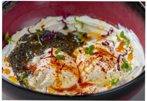
Ottoman Eggs (320 Cal.) AED 32

Poached Eggs, Herb Paprika Oil, Garlic Labneh, Olive Tapenade, Za'atar Pita Bread.