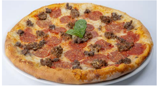
Italian Meat Medley (760 Cal.) AED 58

Italian Home-made Sausage, Meatballs with Beef Pepperoni, San Marzano Tomato Sauce, Hand-Sliced Mozzarella Cheese and Fresh Basil