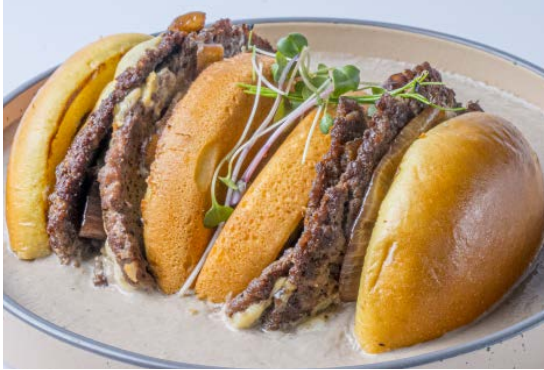
The Dope Burger (1450 Cal.) AED 57 Angus Beef Patty, Caramelized Onion, Herb Mayo, White American Cheddar Cheese Dipped in Mushroom Sauce 🍷🌾🍄