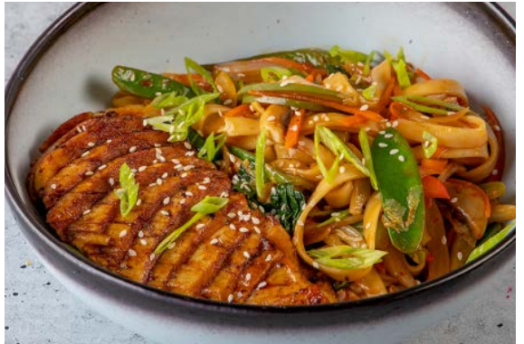
Teriyaki Chicken Noodles (590 Cal.) AED 46

Grilled Chicken Breast, Noodles tossed in Teriyaki Sauce, Snow Peas, Bell Peppers, Bok Choy and Nappa Cabbage.