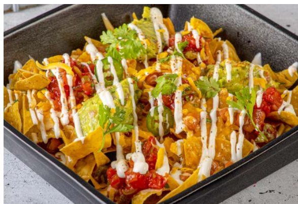
Baked Beans & Nachos (820 Cal.) AED 38

Baked Beans, Nachos, Guacamole, Pico De Gallo, Jalapeños, Cheese Sauce, Sour Cream and Cilantro.