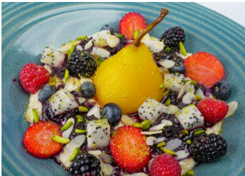
Blueberry & Pear Porridge (560Cal.) AED 42

Passion Fruit Poached Pears, Creamy Rolled Oats, Mixed Berries, Pistachio, and Almond Flakes.