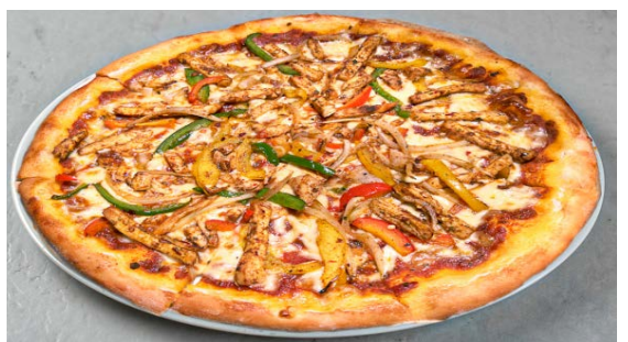
Chicken Fajita (1440 Cal.) AED 47

Grilled Chicken, Bell Peppers, Red Onion, Fajita Seasoning and Hand-Sliced Mozzarella Cheese.