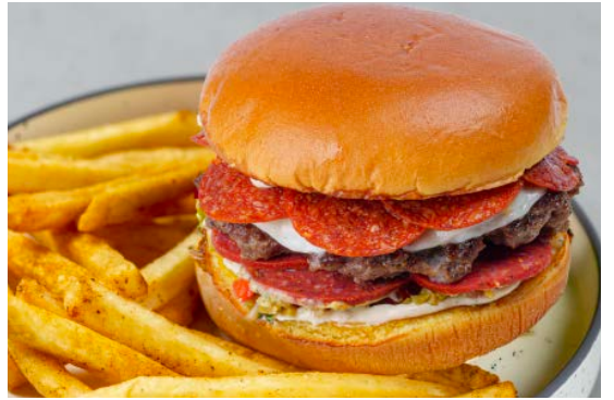
Muffuletta Burger (1300 Cal.) AED 59 Wagyu Beef Patty, Beef Salami, Beef Pepperoni, Olive Salad, Hand-Sliced Mozzarella and Herb Mayo 🍷🌾