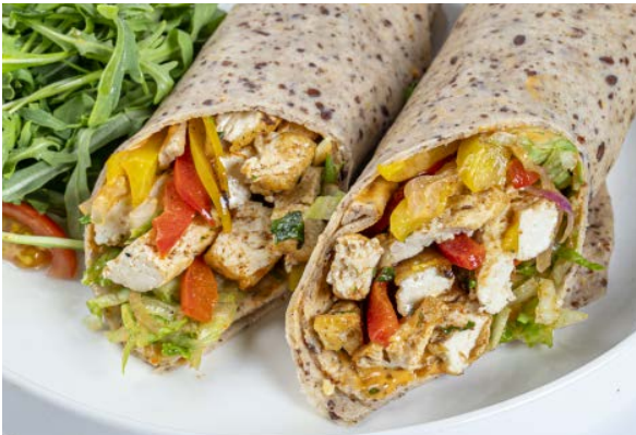
Vegan Tofu Salsa Wrap (580 Cal.) AED 44 Grilled Tofu, Bell Peppers, Salsa Fresco, Iceberg Lettuce, Ranchero wrapped in Keto Flaxseed Almond Wrap.