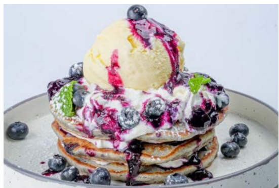
Blueberry Pancake (700 Cal.) AED 46

Blueberry Compote, Fresh Blueberries, Creamy Ricotta, Vanilla Ice Cream and Fresh Mint.