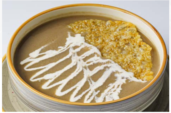
Cream Of Mushroom (520 Cal.) AED 32 Roasted Mushroom, Thyme, Cream served with Focaccia Bread. 🌾🌿🍞