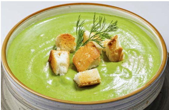
Cream Of Broccoli (440 Cal.) AED 26 Fresh Broccoli, Cream, Onion, Garlic served with Focaccia Bread. 🌾🌿