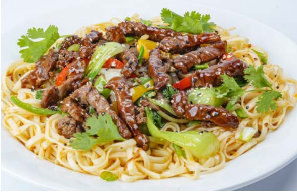
K-Town Stir Fry Beef Noodles (820 Cal.) AED 55

Stir Fry Beef Noodles, Snow Peas, Bok Choy, Onion, Garlic, Ginger, Mushroom, Sesame Seeds and K-Pop Pepper Sauce.