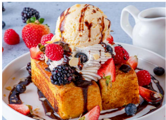
Panettone Toast (1240 Cal.) AED 47

Panettone Bread, Fresh Berries, Caramel Mousse, Chocolate Sauce, Vanilla Ice Cream and Almond Flakes.