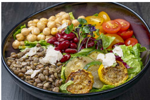
The Super Bowl (610 Cal.) AED 38 Red Lentil, Red Kidney Beans, Boiled Chickpeas, Mixed Greens, Cherry Tomato, Grilled Zucchini, Feta Cheese, and Lemon Herb Vinaigrette Dressing.