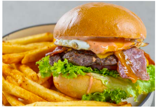
Firehouse Beef Burger (1280 Cal.) AED 57 Angus Double Beef Patty, Beef Bacon Rasher, Fried Egg, American Cheddar Cheese, Cucumber Pickle, Lettuce and Herb Mayo 🍷🥚🌾