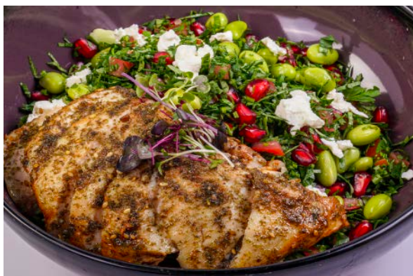
Pomegranate Tabbouleh with Za'atar Chicken (610 Cal.) AED 45 Za'atar Chicken Breast, Tomato, Parsley, Pomegranate, Edamame, Feta Cheese, and Lemon Dressing.