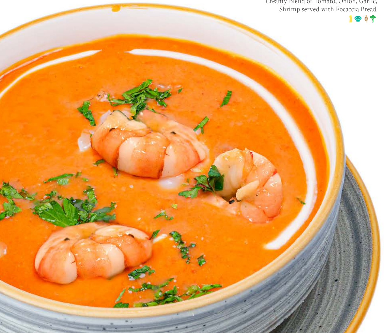
Shrimp Bisque (220 Cal.) AED 36 Creamy Blend of Tomato, Onion, Garlic, Shrimp served with Focaccia Bread. 🌾🍤🌿🍞