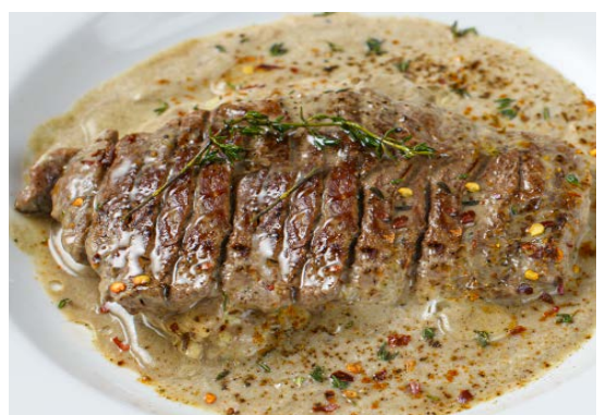
Steak Au Poivre (1410 Cal.) AED 79

Ribeye Steak, Creamy Cashewnut Sauce and Mashed Potatoes.