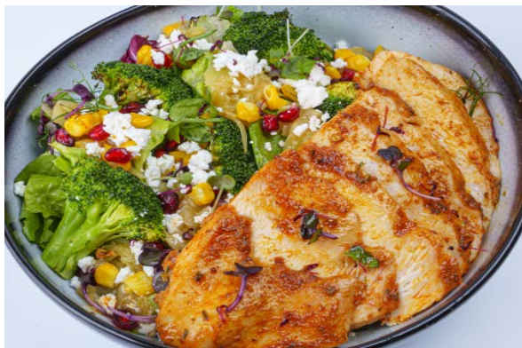
Fennel Chicken Salad (660 Cal.) AED 46 Braised Fennel, Roasted Broccoli, Grilled Chicken Breast, Sweet Corn, Pomegranate, Feta Cheese and Orange Vinaigrette Dressing.