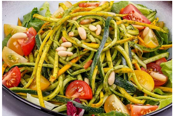
Vegan Pesto Zoodles Salad (380 Cal.) AED 44 Zucchini Noodles, Cherry Tomatoes, Broccoli, Mixed Greens, Pine Nuts and Vegan Pesto Sauce.

Allergens: Dairy Eggs Fish Celery Shellfish Nuts Seeds Gluten Mushroom Cocoa Soybeans