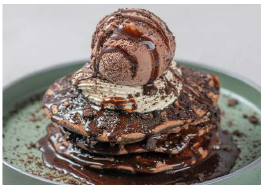
Midnight Darkness (1100 Cal.) AED 44

Oreo Pancakes, Caramel Mousse and Chocolate Ice Cream & Sauce.