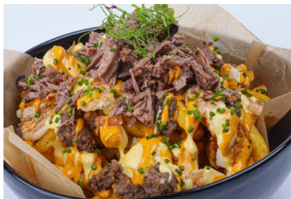
Quattro Fries (1600 Cal.) AED 52

French Fries, Crispy Fried Chicken, Smoked Brisket, Grilled Shrimp, Homemade Italian Beef Sausage, Sriracha Mayo, Cheese Sauce and Crumbled Cheetos.