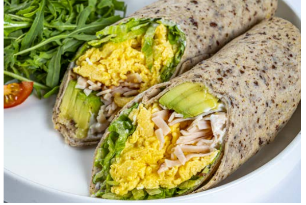
Egg N' Cress Wrap (890 Cal.) AED 44 Scrambled Eggs, Turkey Bacon, Avocado, Iceberg Lettuce, Sour Cream wrapped in Keto Flaxseed Almond Wrap.