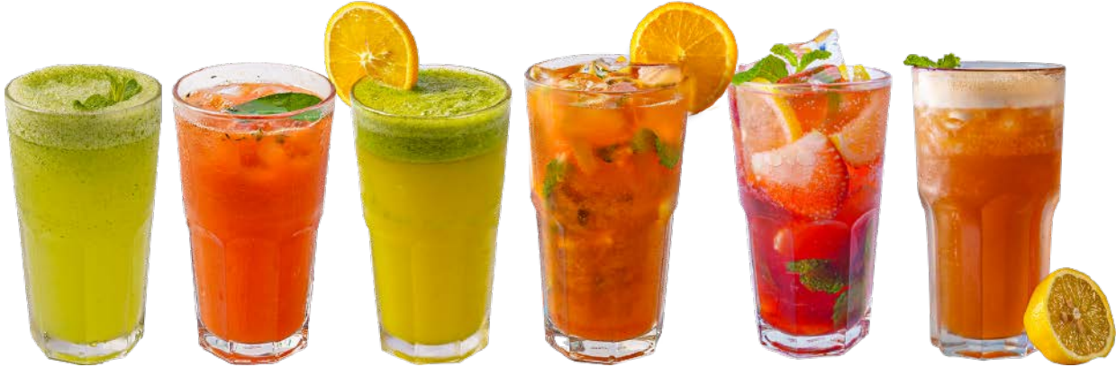
Lemon & Mint

AED 24 (150 Cal.) AED 26 (150 Cal.) AED 22 (160 Cal.)