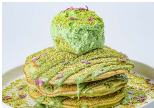
Pistachio Pancake (880 Cal.) AED 46

Pistachio Sauce, Pistachios, Rose Petals, Pistachio Ice Cream and Red Velvet Crumbs.