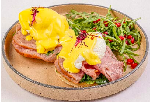
Egg Benedict (780Cal.) AED 36

English Muffins, Poached Eggs, Turkey Ham, Wilted Spinach, Saffron Hollandaise and Rocket Salad.