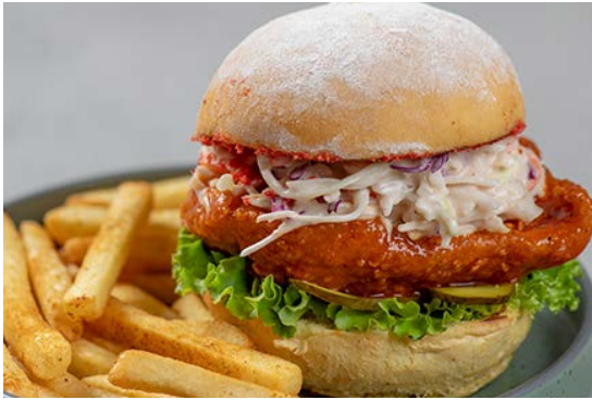
Nashville Hot Chicken Burger (1430 Cal.) AED 46 Crispy Fried Chicken Dipped in Hot Nashville Sauce, Cucumber Pickle, Cheetos, Lettuce, Coleslaw and Herb Mayo. 🍷🌾