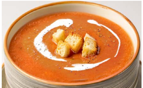
Creamy Tomato Soup (217 Cal.) AED 25 Tangy Tomatoes Blended with Spices and Herbs served with Focaccia Bread. 🌾🌿🍞