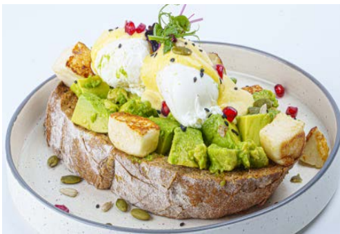
Sourdough With Avocado (360 Cal.) AED 34

Poached Eggs, Grilled Halloumi, Cherry Tomatoes, Avocado, Pomegranate, Pumpkin Seeds, Saffron Hollandaise and Olive Oil.