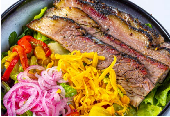
Smoked Brisket Salad (850 Cal.) AED 50 Sliced Smoked Brisket, Roasted Bell Peppers, Lettuce, American Cheddar Cheese, Cherry Tomatoes, Onion Pickle with Coriander Vinaigrette.