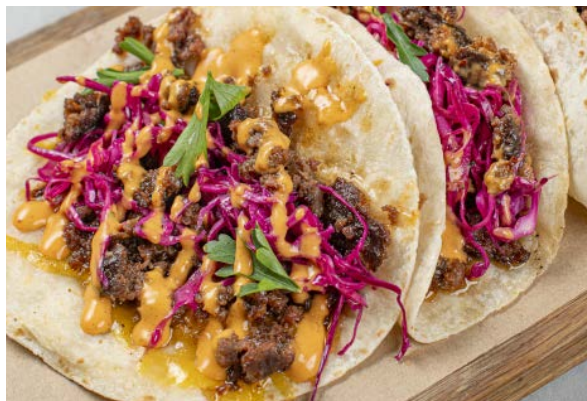
Wagyu Beef Tacos (790 Cal.) AED 44

Flour Tortilla, Wagyu Beef, Cheddar Cheese, Red Cabbage Pickle, BBQ Sauce and Sriracha Mayo.