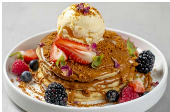
Lotus Dreams (1090 Cal.) AED 44

Fresh Berries, Biscoff Sauce, Coconut Shavings, Lotus Crumbles and Vanilla Ice Cream.